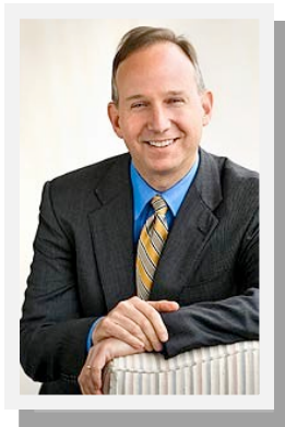
Featuring our Governor Jack Markell

Quality of Life, Economic Development, and Health Promotion